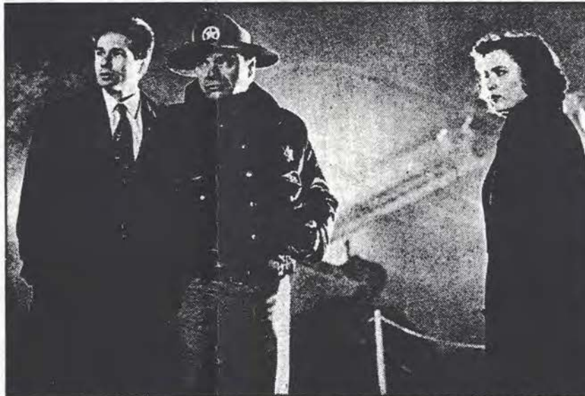
ON 'FILES': David Duchovny, left, as an FBI agent who investigates paranormal phenomena, Alan Tudyk, and Gillian Anderson as Duchovny's skeptical partner.

His partner, the skeptical Dana Sculley (Gillian Anderson), looks for logic in the inexplicable. One thing she believes in: Mulder's belief. Tonight, in an episode steeped in ominous government conspiracy theory, she calls his passion "so intense that sometimes it's blind-